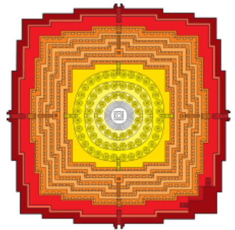
■ Kāmadhātu ■ Rūpadhātu ■ Arūpyadhātu

The vertical cosmology is divided into thirty-one planes of existence and the planes into three realms, or dhātus , each corresponding to a different type of mentality. These three realms (Tridhātu) are the Ārūpyadhātu (4 Realms), the Rūpadhātu (16 Realms), and the Kāmadhātu (15 Realms). In some instances all of the beings born in the Ārūpyadhātu and the Rūpadhātu are informally classified as "gods" or "deities" ( devāḥ ), along with the gods of the Kāmadhātu , notwithstanding the fact that the deities of the Kāmadhātu differ more from those of the Ārūpyadhātu than they do from humans. It is to be understood that deva is an imprecise term referring to any being living in a longer-lived and generally more blissful state than humans. Most of them are not "gods" in the common sense of the term, having little or no concern with the human world and rarely if ever interacting with it; only the lowest deities of the Kāmadhātu correspond to the gods described in many polytheistic religions.